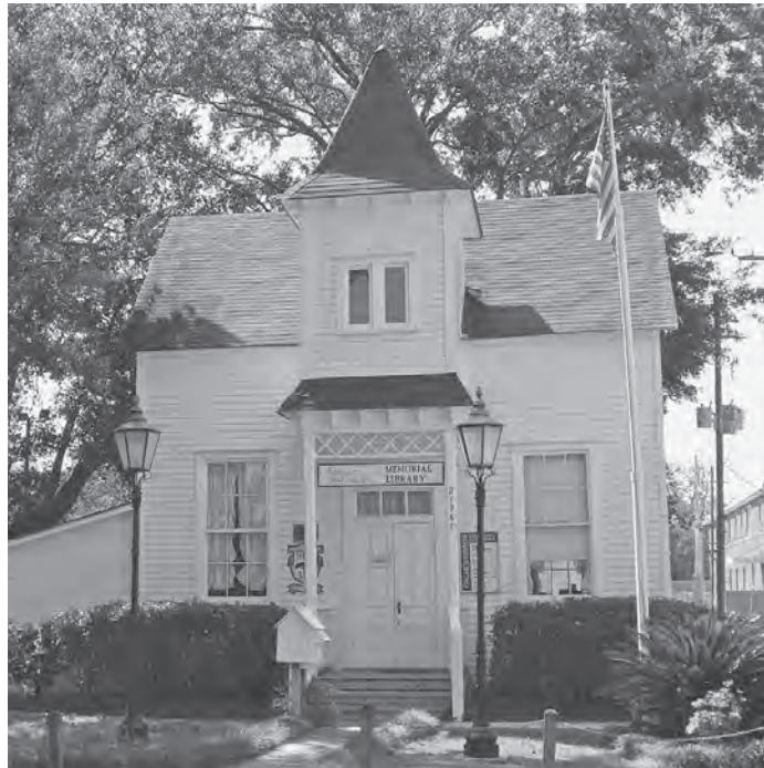
The Oscar Johnson Memorial Library, formerly the Svea Land Company office, in Silverhill, Alabama.