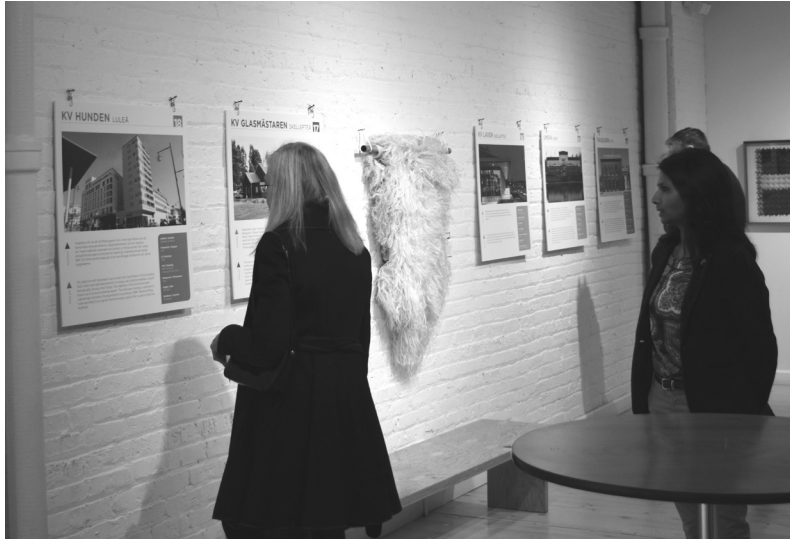
Main gallery exhibit: 22 Sustainable Houses